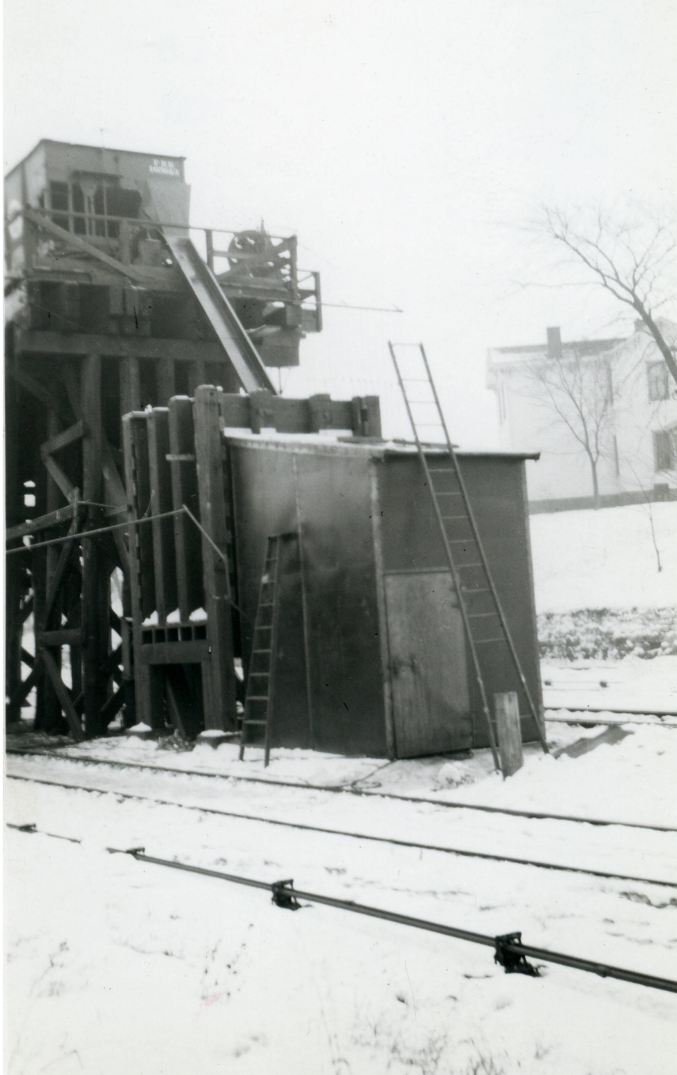
It looks like there was a small bunker at ground level. Maybe this was for coaling up cabin cars